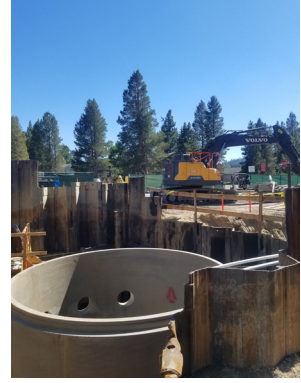
(Clockwise) Repairing wastewater clarifier; Tahoe Keys pump station upgrade; installing a new water main.