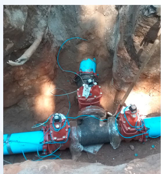
(L to R) Due to aging pipes, there are many leaks that need to be repaired; Installing a new water main.